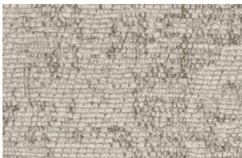
VALANTE 9050 - 05