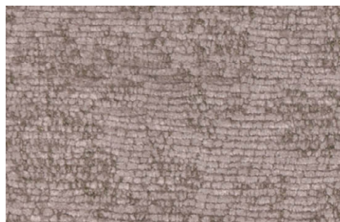
VALANTE 9050 - 04