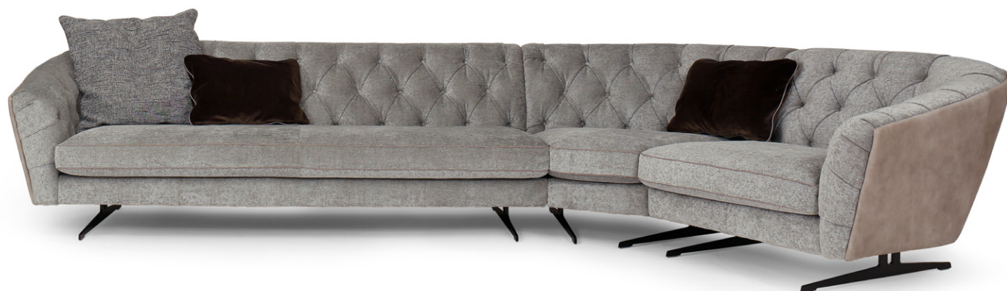
NEW KAP - VALANTE 9050 - 02