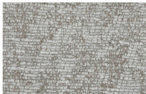
VALANTE 9050 - 02