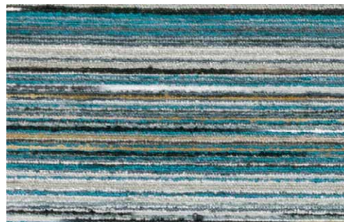
TULUA 9080 - 02