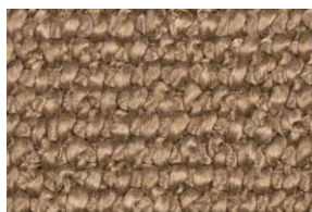
SERRA L1634 - 05