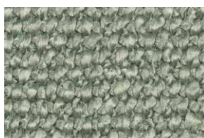
SERRA L1634 - 11