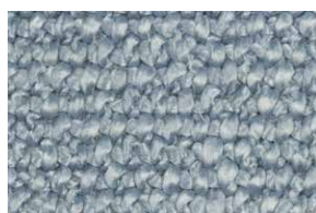
SERRA L1634 - 09