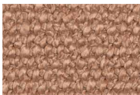
SERRA L1634 - 04