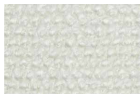
SERRA L1634 - 01