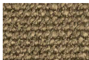
SERRA L1634 - 06