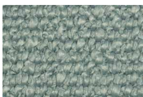
SERRA L1634 - 10