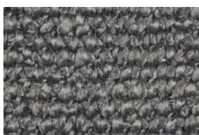
SERRA L1634 - 07