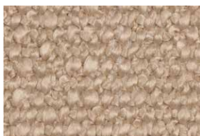
SERRA L1634 - 03