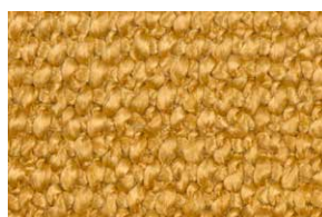
SERRA L1634 - 14