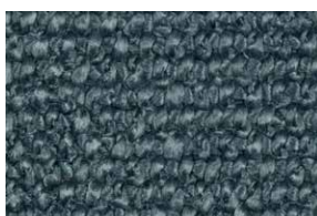
SERRA L1634 - 12