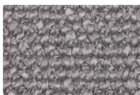
SERRA L1634 - 15