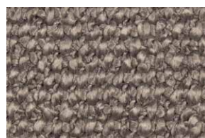
SERRA L1634 - 13