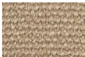
SERRA L1634 - 02