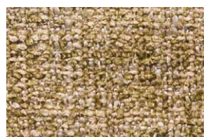
PORTO CERVO L1571 - 18