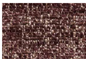
PORTO CERVO L1571 - 24