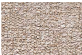
PORTO CERVO L1571 - 30