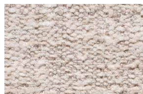
PORTO CERVO L1571 - 02