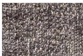
PORTO CERVO L1571 - 93