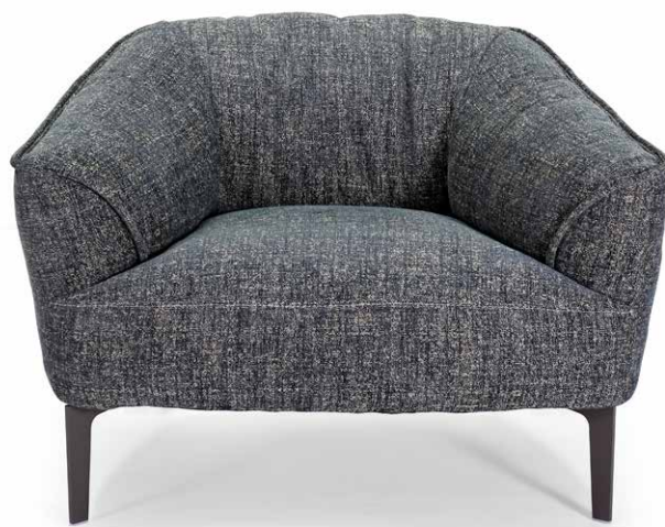
SIGMUND - PORTO CERVO L1571 - 82

Tutte le immagini sono inserite a scopo illustrativo, i colori sono puramente indicativi e possono differire dai toni reali. All images are shown for illustrative purposes, the colors are purely indicative and may differ from the real tones. Toutes les images sont présentées à titre d'illustration, les couleurs vues sur l'écran sont purement indicatives et peuvent différer des tons réels.