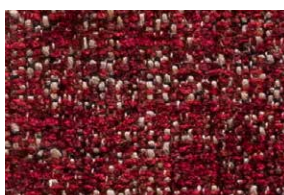
PORTO CERVO L1571 - 51