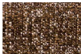
PORTO CERVO L1571 - 34