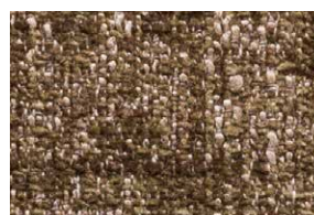
PORTO CERVO L1571 - 40