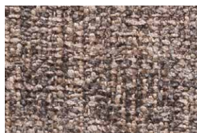
PORTO CERVO L1571 - 92