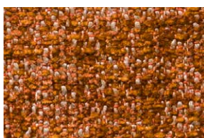
PORTO CERVO L1571 - 59