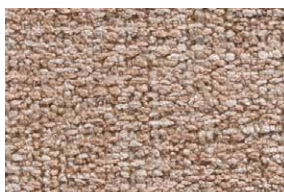
PORTO CERVO L1571 - 07