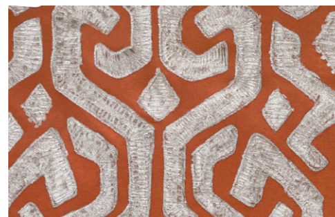
DAMMUSO Z596 - 06