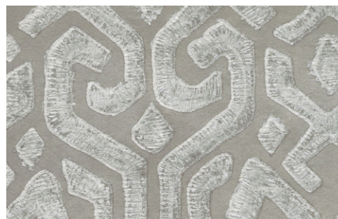
DAMMUSO Z596 - 02