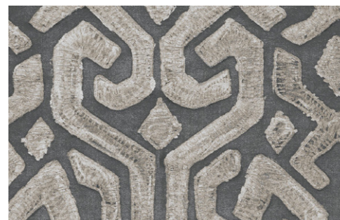
DAMMUSO Z596 - 03