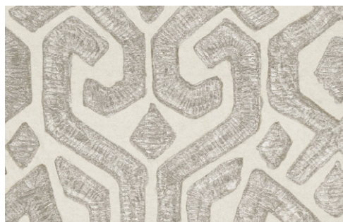
DAMMUSO Z596 - 01