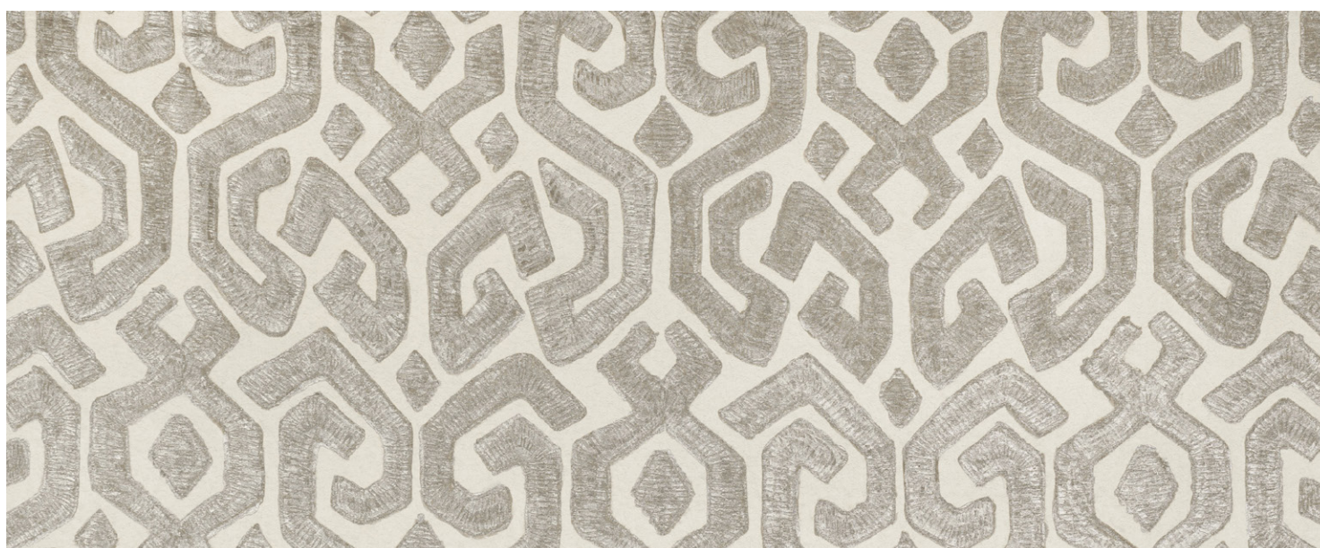
DAMMUSO Z596 - 01

Tutte le immagini sono inserite a scopo illustrativo, i colori sono puramente indicativi e possono differire dai toni reali. All images are shown for illustrative purposes, the colors are purely indicative and may differ from the real tones. Toutes les images sont présentées à titre d'illustration, les couleurs vues sur l'écran sont purement indicatives et peuvent différer des tons réels.