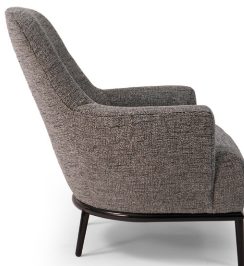
ESME - CINERA 9054 - 03

Tutte le immagini sono inserite a scopo illustrativo, i colori sono puramente indicativi e possono differire dai toni reali. All images are shown for illustrative purposes, the colors are purely indicative and may differ from the real tones. Toutes les images sont présentées à titre d'illustration, les couleurs vues sur l'écran sont purement indicatives et peuvent différer des tons réels.