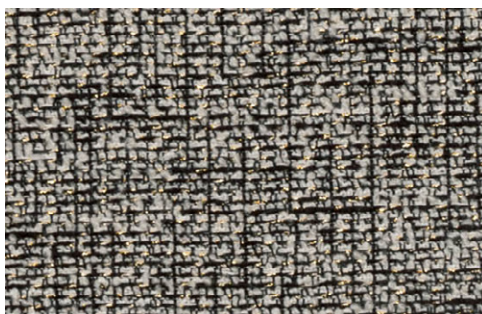
CINERA 9054 - 03