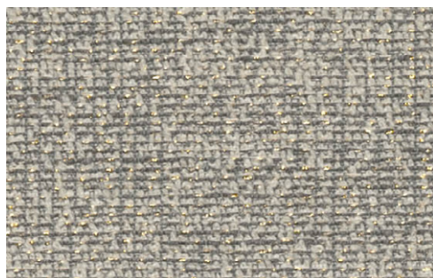
CINERA 9054 - 02